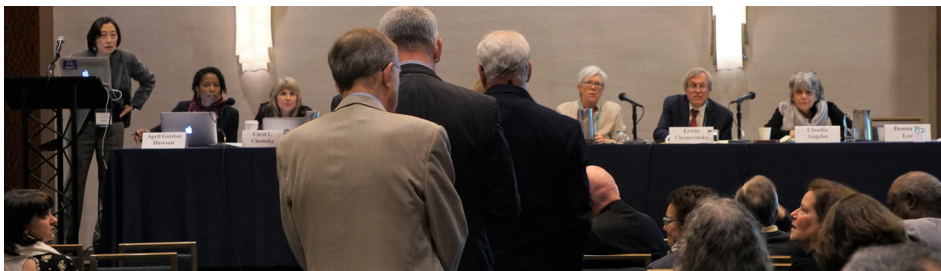
Audience members line up to pose questions during the discussion portion of the Hot Topic program on bar exam scores and new ABA pass standards.