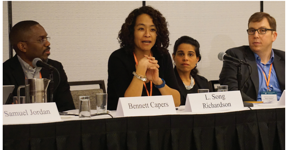
"Scholarly Engagement Post-Tenure," an Arc of Career Program at the 2016 AALS Annual Meeting

At that time, the Professional Development Committee handled programming for the AALS mid-year meetings. As travel and hotel costs rose and school travel budgets decreased, however, the previous mid-year meeting model became unsustainable. In 2014,