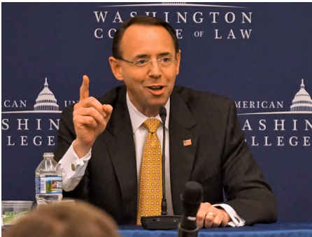
Rod Rosenstein, Deputy U.S. Attorney General addresses AALS Midyear Meeting attendees.