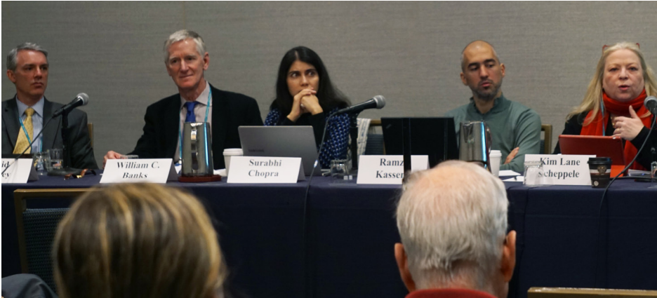
National Security Law panel at the 2017 AALS Annual Meeting

nexus to immigration, for example. This connection between immigration and national security law is raising students' awareness that national security law encompasses a wide swathe of legal and policy issues. I see my students currently grappling with such connections in criminal procedure, where they're making connections among surveillance, criminal procedure, and the federal government under the auspices of national security—which fuels an interest in national security law.