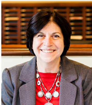
Associate Dean for Student Affairs and Communications at the University of Maryland Francis King Carey School of Law and Immediate-Past Chair of the Board of Trustees of the Law School Admission Council

The combination of the Internet as well as the rise of the rankings and of critics of legal education has led to another phenomenon that simply didn't exist 35 years ago. There exists a cohort of law students who enroll in whatever school admits them and provides the best economic package for the first year, with the explicit plan to “trade up” at the end of the first year. This is not a development about which I can say anything positive from the perspective of someone who is trying to maintain a community.