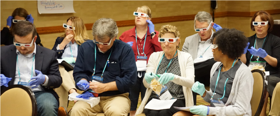
Attendees participating in an exercise during the session “Teaching Empathy to Millennials for These Tumultuous Times.”