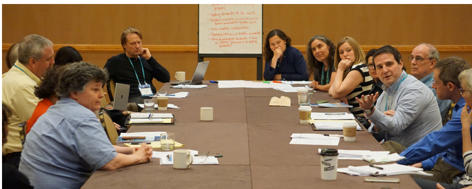
Attendees at an AALS Clinical Conference working group