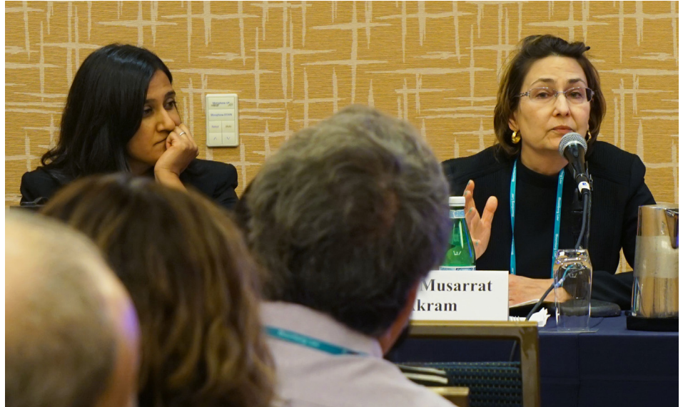
Section on Immigration Law panel at the 2017 AALS Annual Meeting

What can you tell me about your program at the 2018 Annual Meeting?